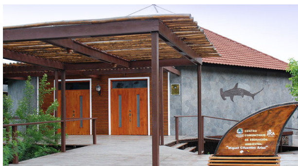
Centro Comunitario de Educación Ambiental "Miguel Cifuentes".

The fifth edition of the Nanoscience Summer School at Yachay Tech international edition will be held at the Environmental Community Center "Miguel Cifuentes", Puerto Ayora - Galapagos in Ecuador.