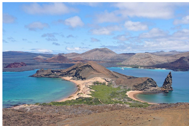
Bartolomé Island - Galápagos

experience. Picture yourself walking amongst giant turtles, sea lions and exotic birds or swimming alongside whale sharks and giant manta rays who have no fear of man and are just as curious about you as you are about them. This unique opportunity is only possible in the Galapagos Islands. Located 1.000 kilometers (600 miles) on the Ecuadorian Pacific Coast, the islands are a living museum and showcase of evolution. Declared a Natural World Heritage Site by UNESCO in 1979, the Galapagos have also been recognized as the 1st destination to visit before you die by the readers of USA TODAY.